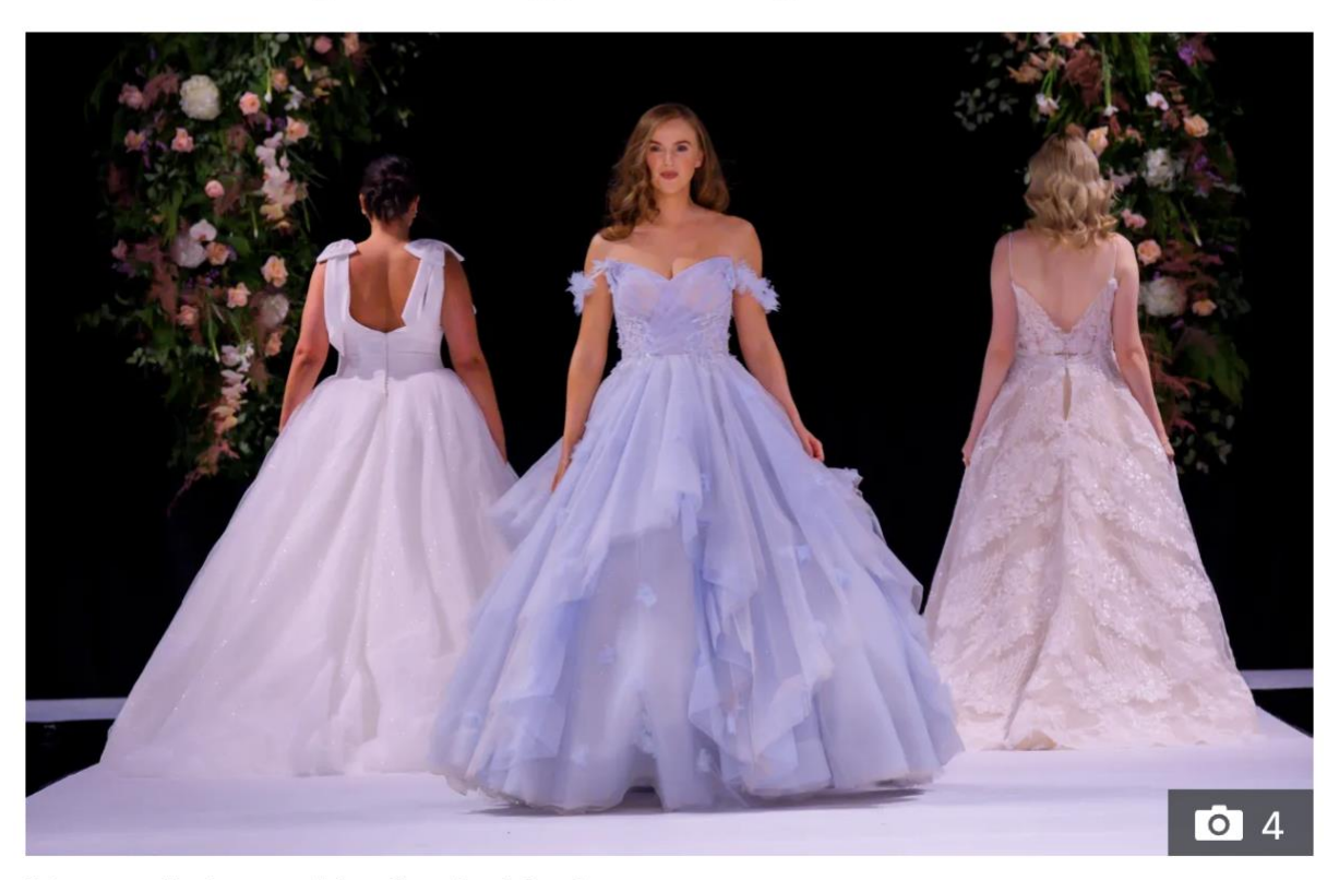
It's not all about white for the big day anymore

Couples getting spliced in 2024 are starting to plan in earnest, with the Scottish Wedding Show taking place in Glasgow this weekend.