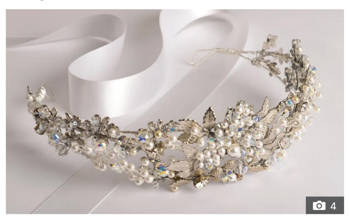
Embellished headbands are going to be popular

The <u>Scottish Wedding Show</u> runs February 17 and 18 at the SEC, Glasgow